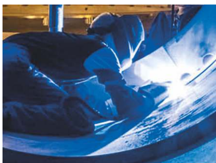
TIG welding of stainless steel