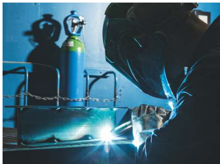
MIG welding of aluminium

The high-performance gas shielding solution for TIG and MIG welding of all materials